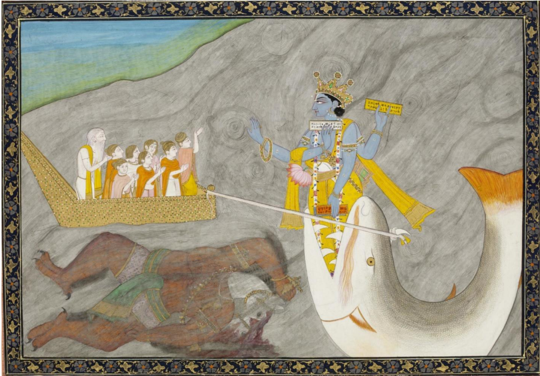
Matsya-avatara of Lord Vishnu pulls Manu's boat after having defeated the demon